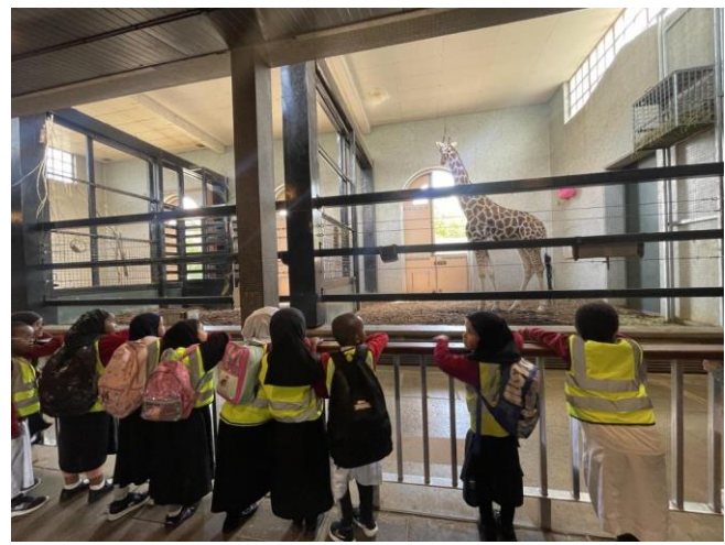
Year 1 have been to the Zoo for which was linked to their science topic